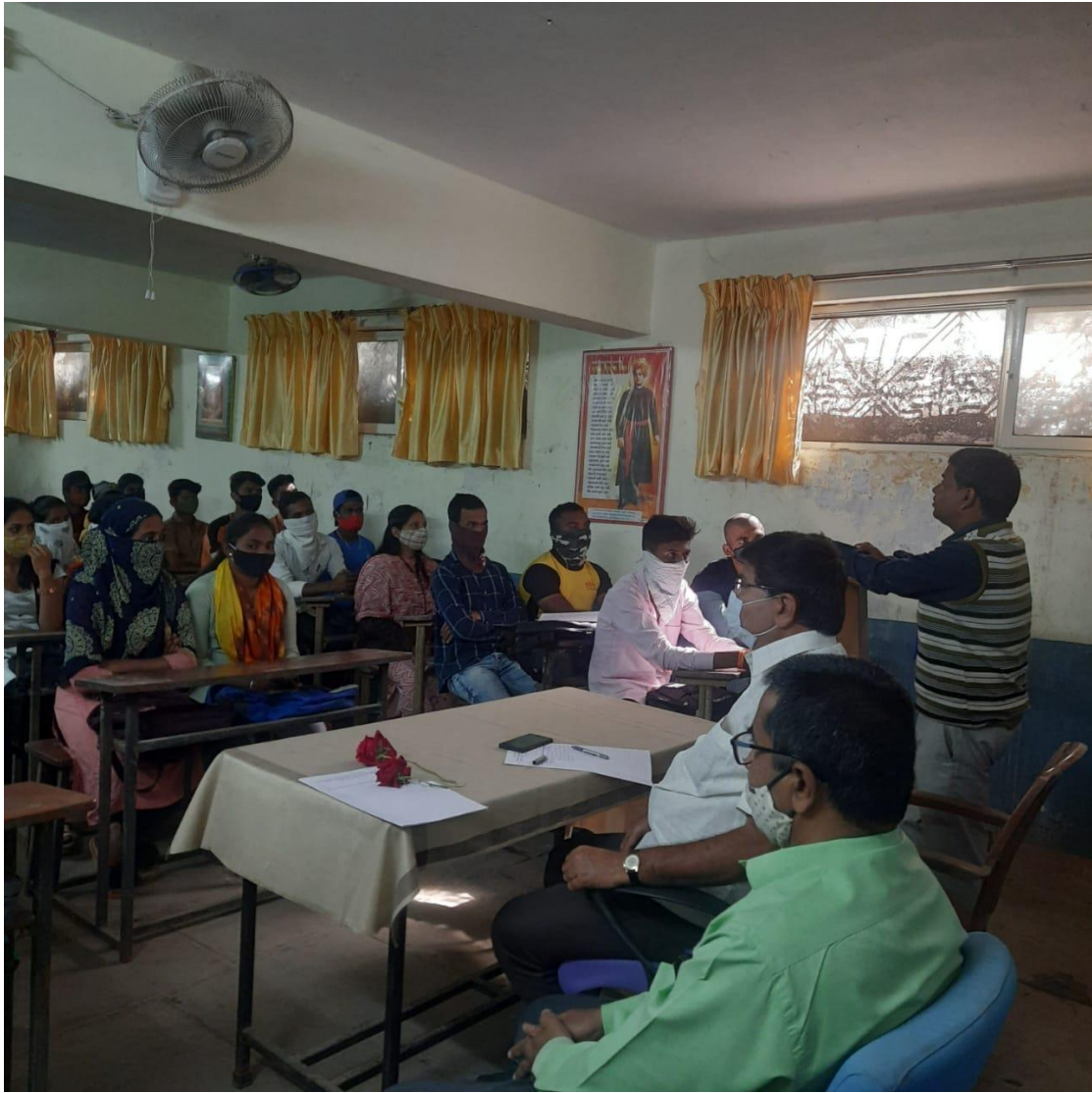
Sant Sevalal Jayanti