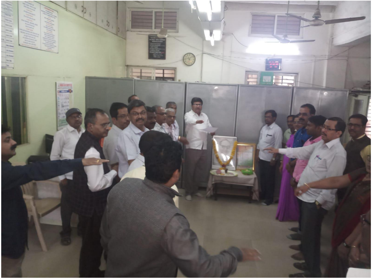
Constitution Day Pledge