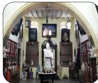
Keki Moos Gallery