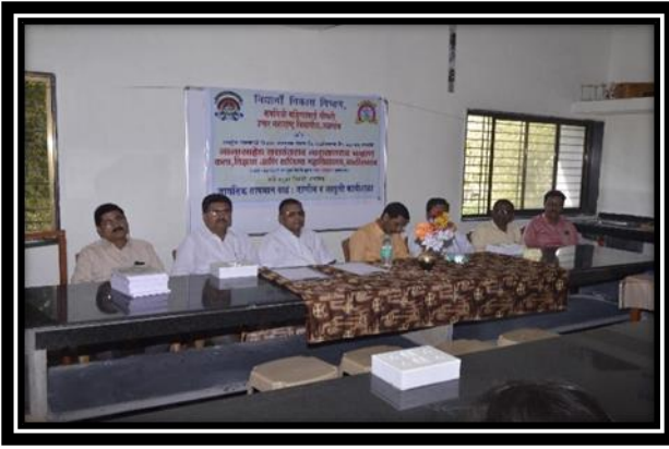
Members on Dias