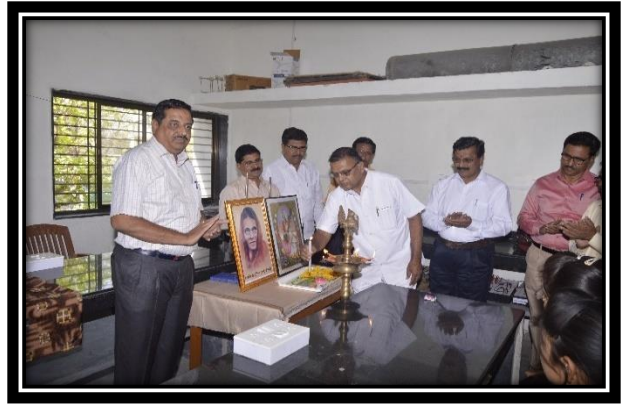
Lamp Lighting Ceremony