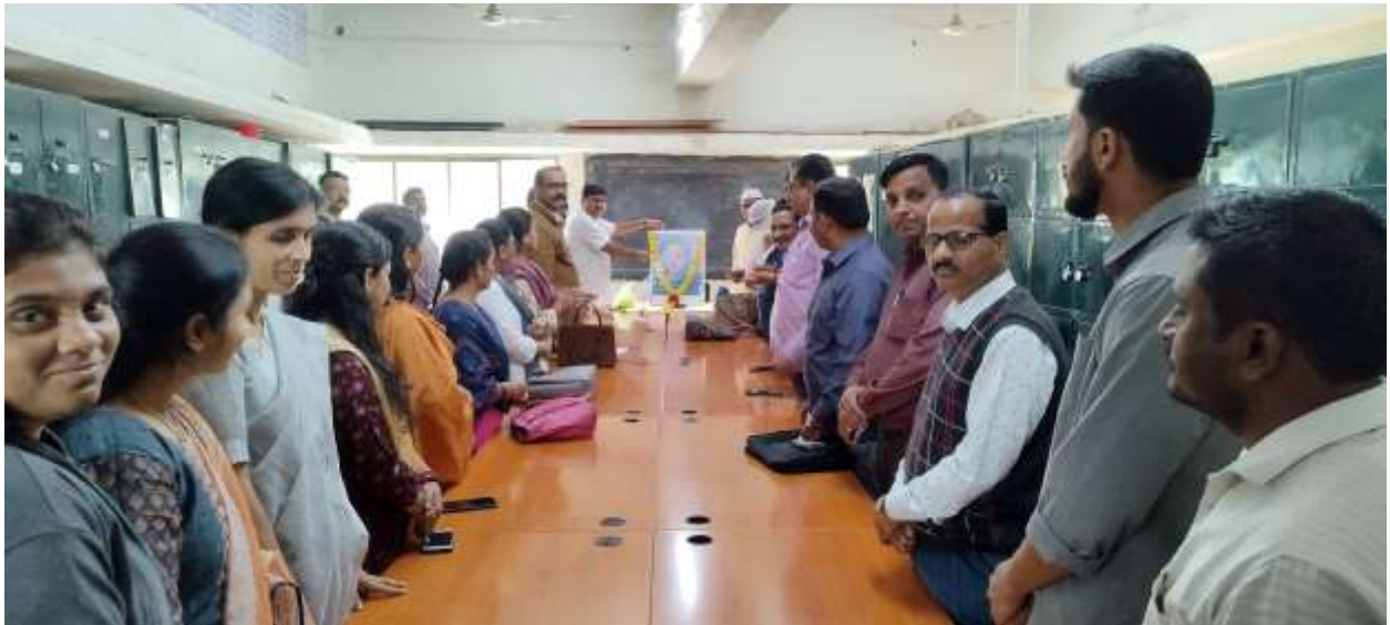
Savitribai Phule Jayanti