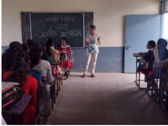
International Women's day Celebration on 08/03/2023 by Department of Marathi